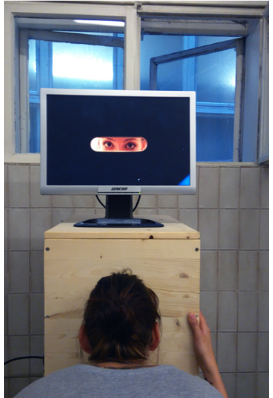
Parallel Vienna, 2016